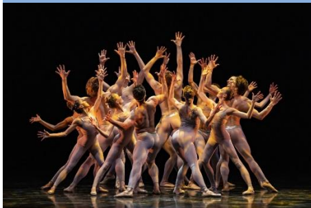
Ballet West in "Light Rain".

To learn more about the celebration this weekend, please read here and here .